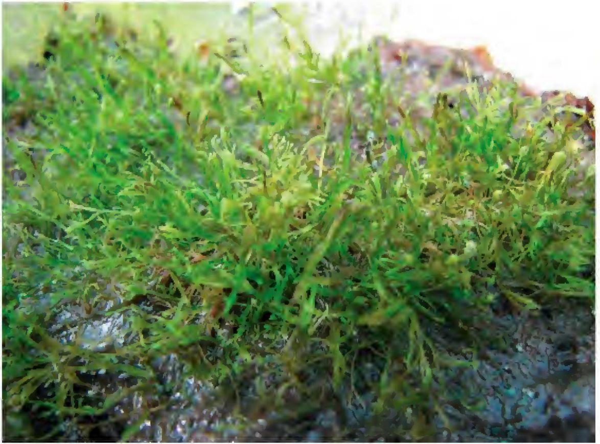
Figure 8: Terrestrial greenhouse culture of U. neottioides on brown peat. The maximum height of the shoots is ca. 2 cm.

decay occurred. Surprisingly, plants survived relatively better and longer when placed at the bottom of aquaria in deeper shade. Similar to e.g. U. floridana shoots, the dense cover of partly hydrophobic hairs on U. neottioides shoots renders these hydrophobic. Due to water surface tension, the stolons remain adhered to the water surface. When a small plant fragment was enclosed in a 0.5 liter bottle containing humic water with a high CO 2 concentration, survival was somewhat longer but no new growth was observed.